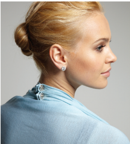
6. Lift the connected ends over your head and place around your neck