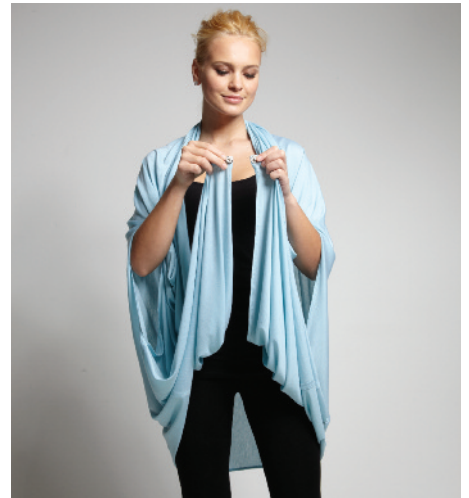
5. Take the two remaining ends and snap them together