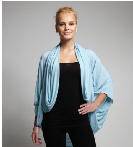
You've just learned how to make a fun shrug