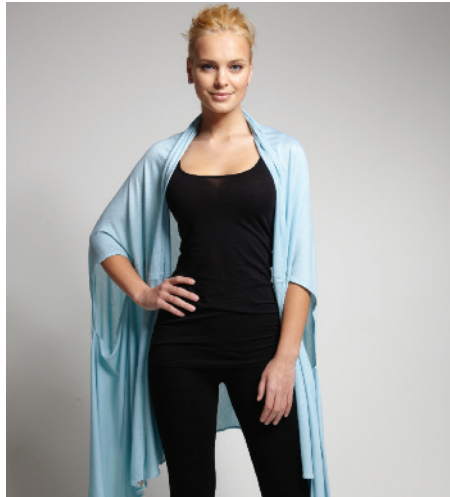
2. Slip your arms through the slits