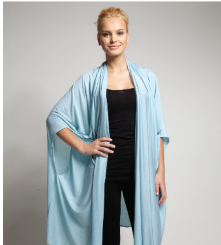
Style tip: For a longer shrug simply stop here