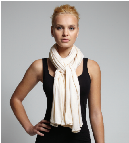
You've just learned how to make a fashionable scarf