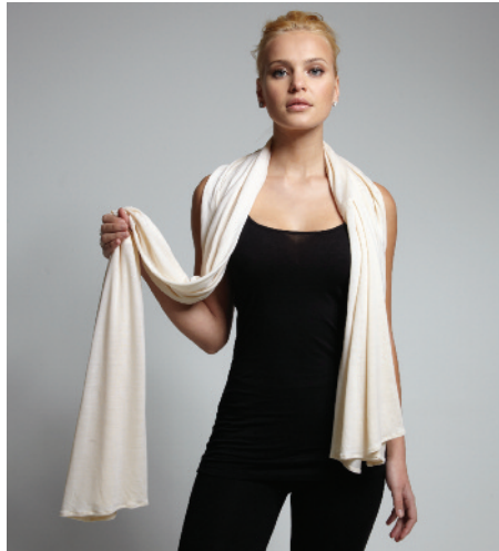
2. Place the fabric around your neck lengthwise keeping one side longer than the other