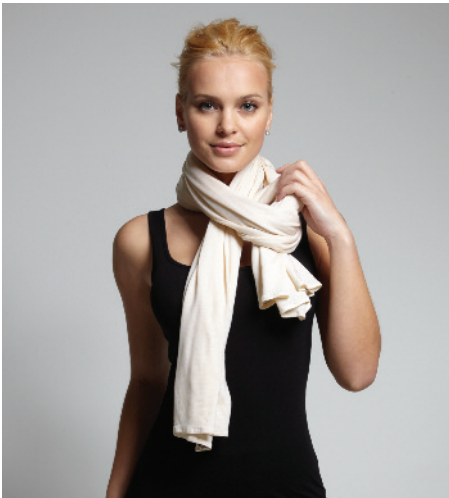
4. Continue with the longer end, place it under the shorter end and pull it through the loop