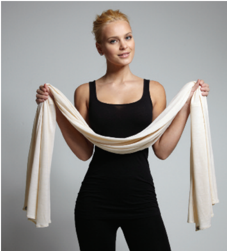
1. Gather The Bina™ lengthwise